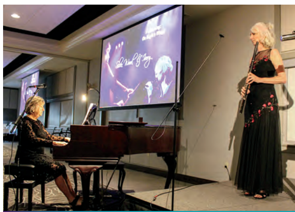
Silver, Wood & Ivory performing